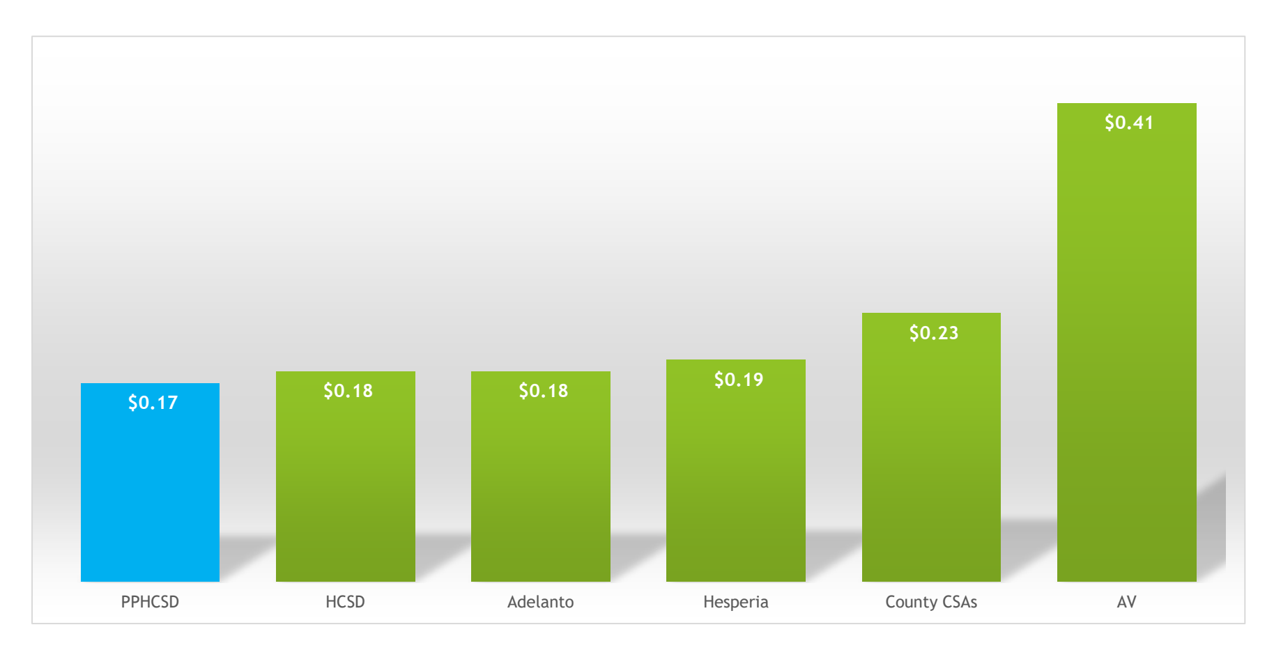
Rate Comparison - Res. Price/Gallon