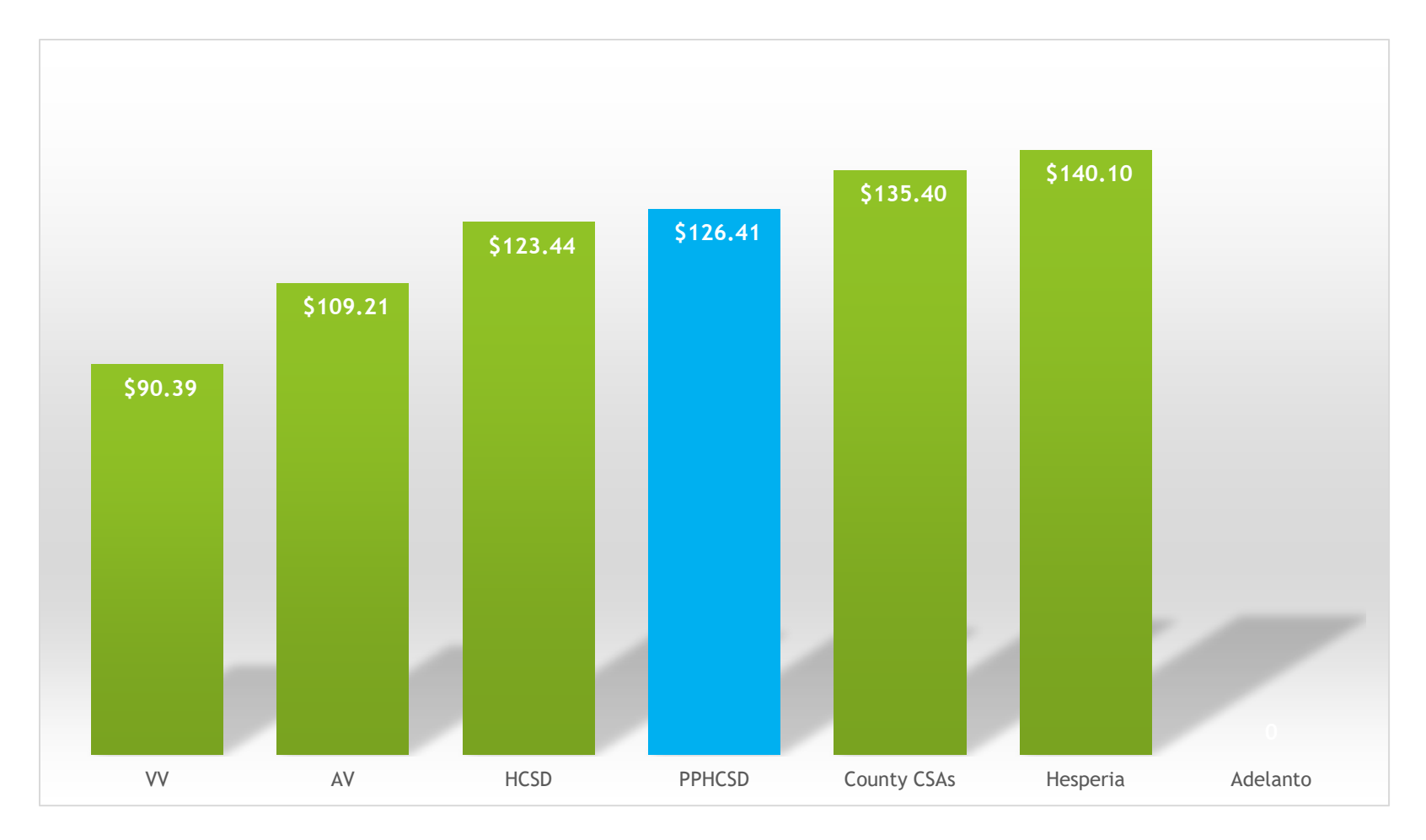
Rate Comparison - Res. Bin Service